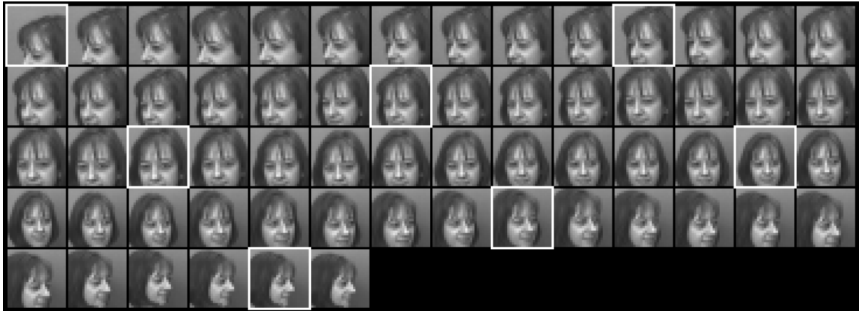
Figure 1. A complete Primary sequence for class carla , after segmentation but before pre-processing (boxes indicate frames used for training with selection interval of 10).