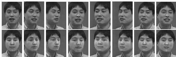
Figure 5. Tracking faces with significant expression change.

state-invariant model defined by (14) is used on the basis of subject constancy.