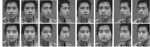
Figure 4. Tracking faces undergoing large pose change. The first row is original images from sample frames, and the second row shows the reconstructed face patterns overlapped on the original images.

As stated in Section 2.2, the 3D PDM shape model is trained from 2D images with limited pose range where all landmarks are visible. To verify if the model generalises well on out-of-range poses, we applied the model on sequences where faces are undergoing large pose change. The pose range in those sequences are normally profile to profile.